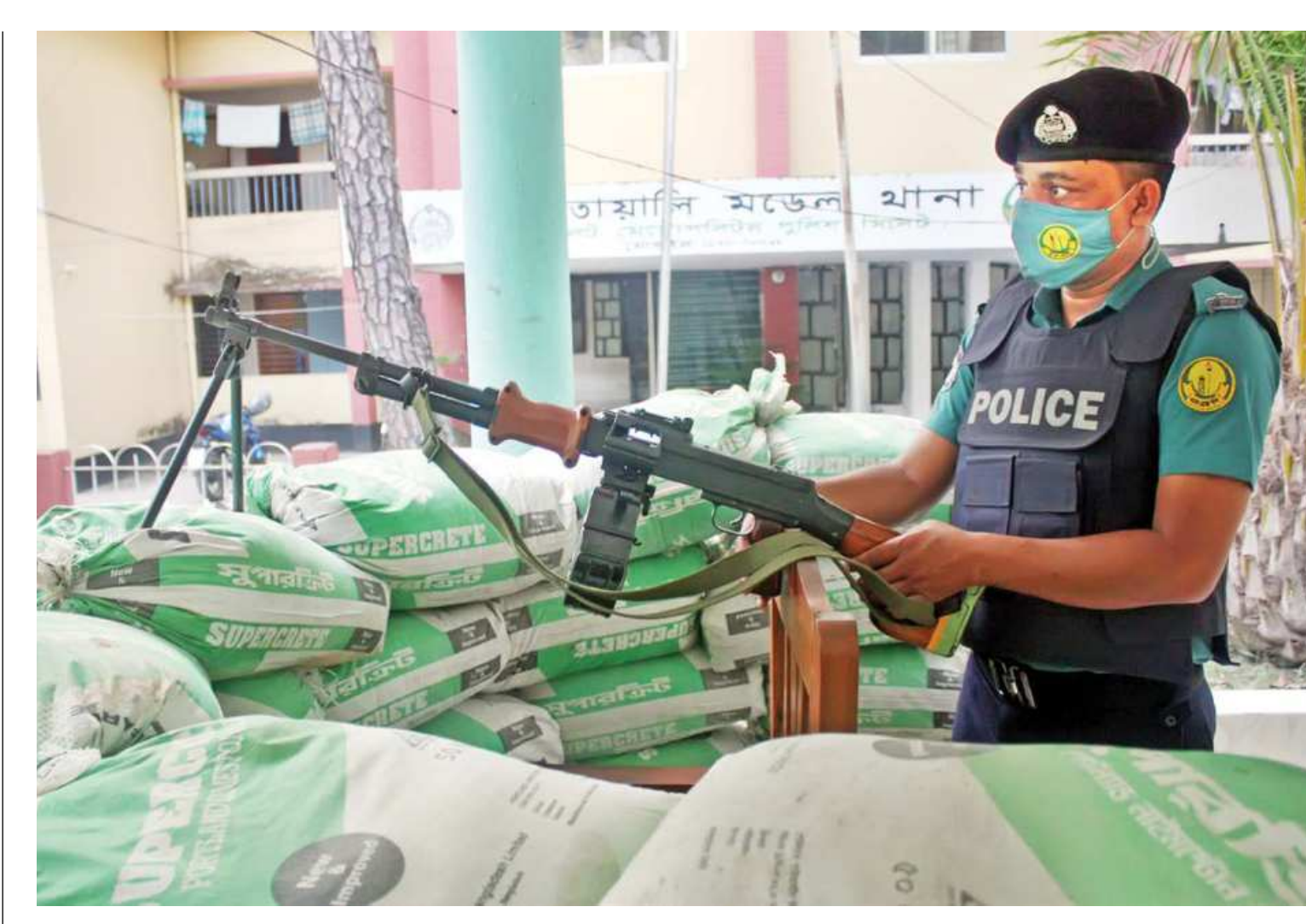
A policeman stands guard with a gun at Kotwali Police Station in Sylhet. The authorities have taken additional security measures at police stations after Hefajat activists attacked police establishments in the region.

This is the first time the D-8 held the Youth Summit, she said, adding, "Let's take the benefit of the demographic SEE PAGE 10 COL 6