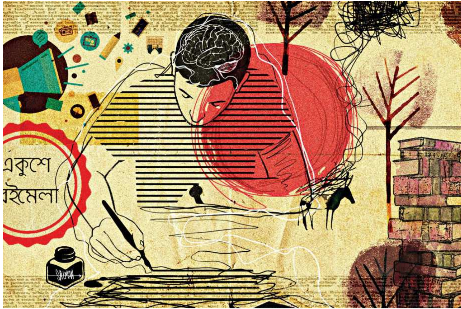
ILLUSTRATION: SALMAN SAKIB SHAHRYAR