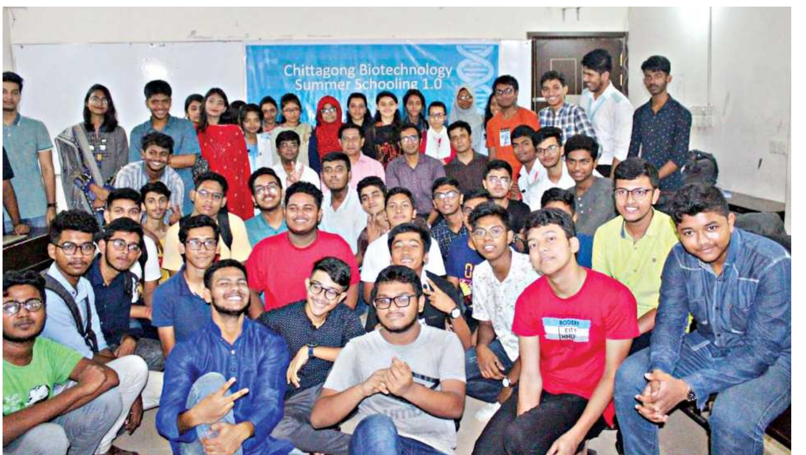
WBSB team members at their Biotechnology Summer Camp, before the pandemic hit.

The author is a marketing student from North South University. Write to her at sadiatahsin98@gmail.com .