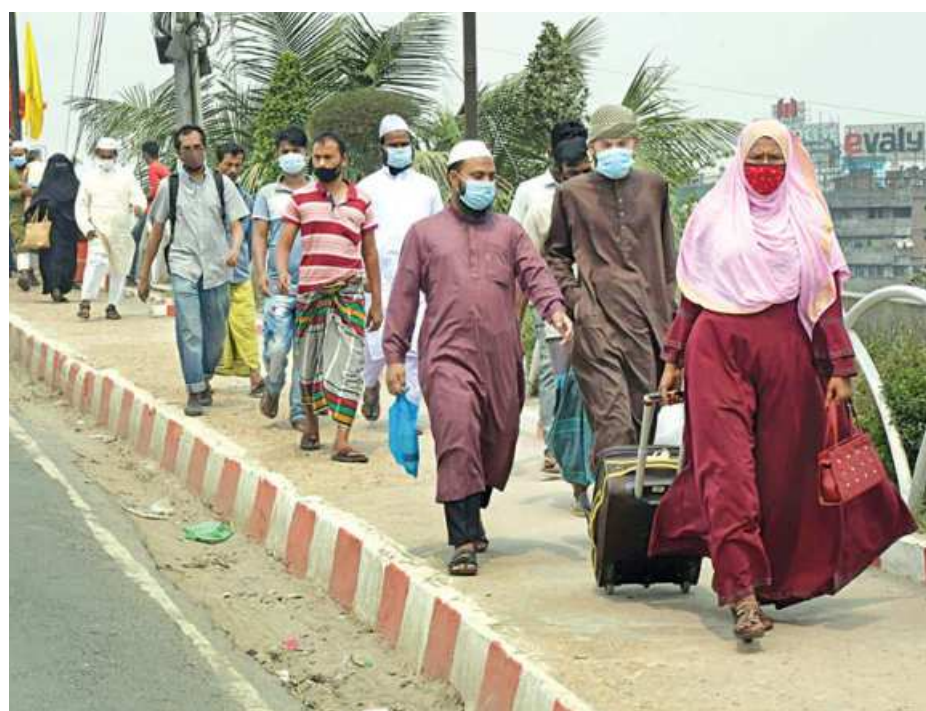
As long-haul buses are not operating due to Covid-19 restrictions, people entering the capital had to get down in Amin Bazar and cross the Gabtoli bridge on foot before heading towards their destination in the city. Bottom, people crowd the Agrabad branch of Sonali Bank as banking hours have been reduced.

The country has direct communication with UK, with hundreds of expatriates coming to Bangladesh every month. In December last year, a new strain of SEE PAGE 2 COL 3