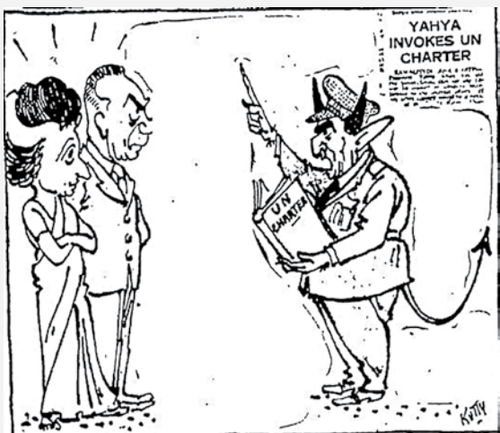
Devil quoting scripture. The cartoon was published in the Hindusthan Standard on April 9, 1971.