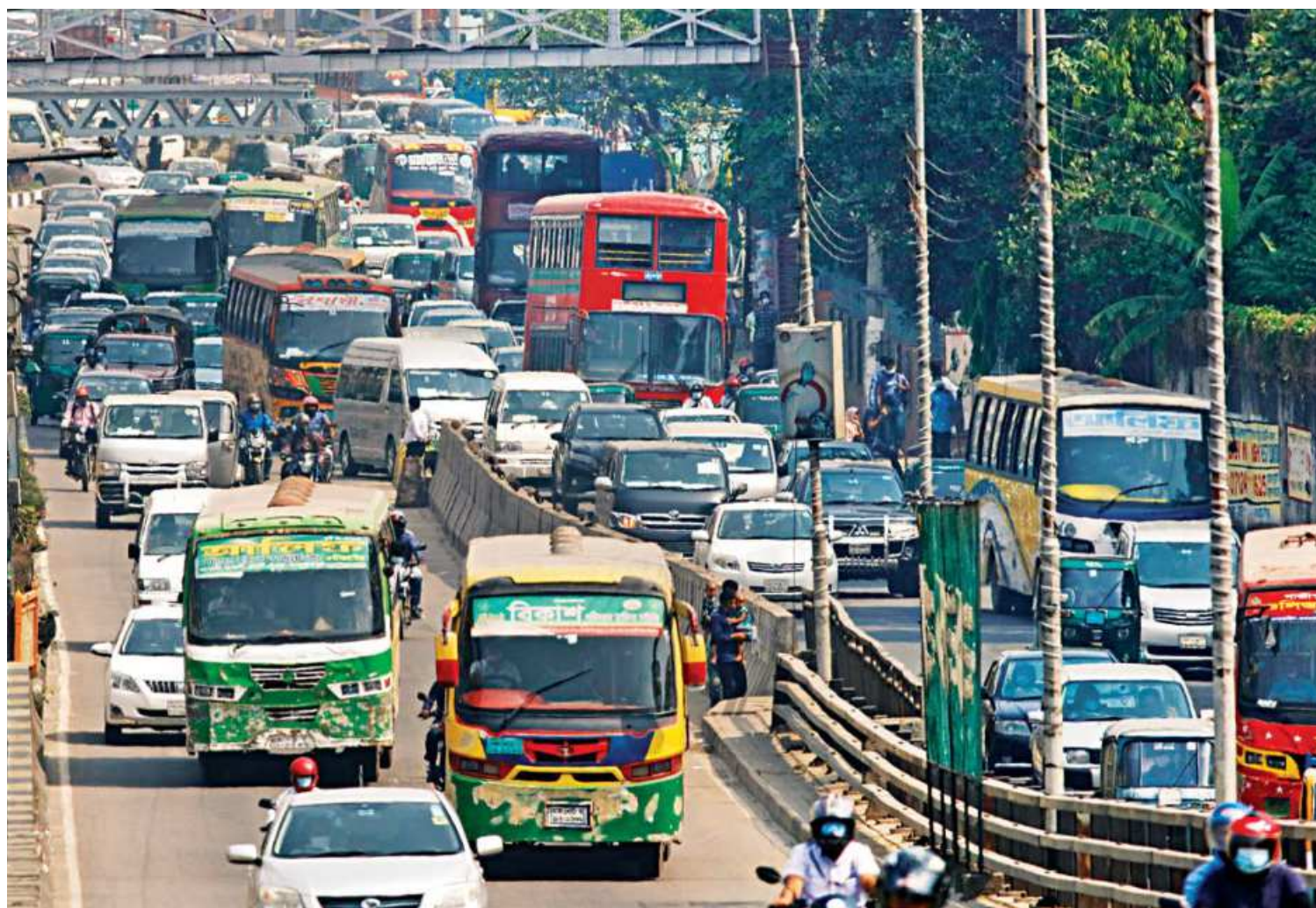
A number of buses plying the Banani airport road after restrictions on public transport were relaxed on the third day of the government-imposed "lockdown", causing heavy traffic in some areas of the capital. The photo was taken yesterday.