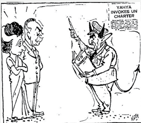
Devil quoting scripture. The cartoon was published in the Hindusthan Standard on April 9, 1971.