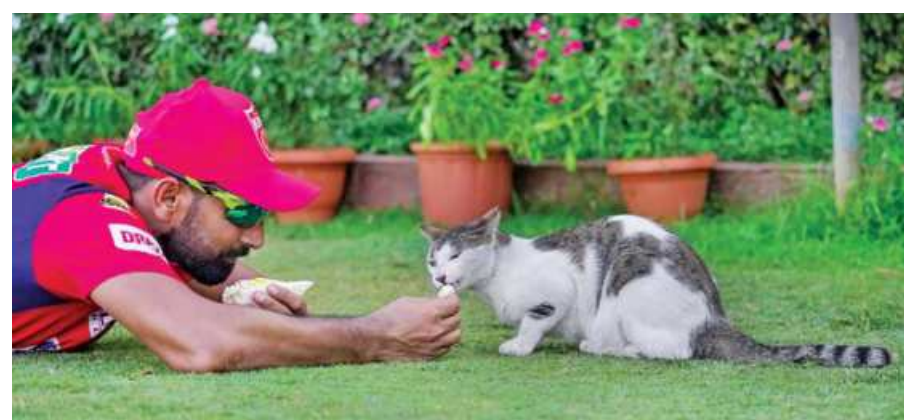
India and Punjab Kings pacer Mohammed Shami feeds a cat during practice yesterday.

Champions Mumbai Indians, captained by Rohit Sharma, and Virat Kohli's Royal Challengers Bangalore get the eight-team tournament going at M.A. Chidambaram Stadium on Friday.