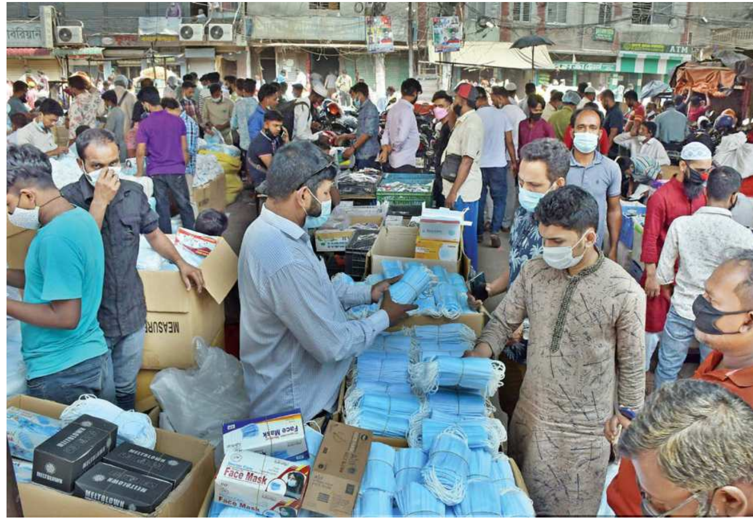
The wholesale market under the second Buriganga bridge on Mitford Road's Babubazar is full of hand sanitizers and masks for sale as the demands for such products have increased with the rising Covid-19 infection rate. Taking advantage of this, salesmen have increased the prices of masks and sanitizers.