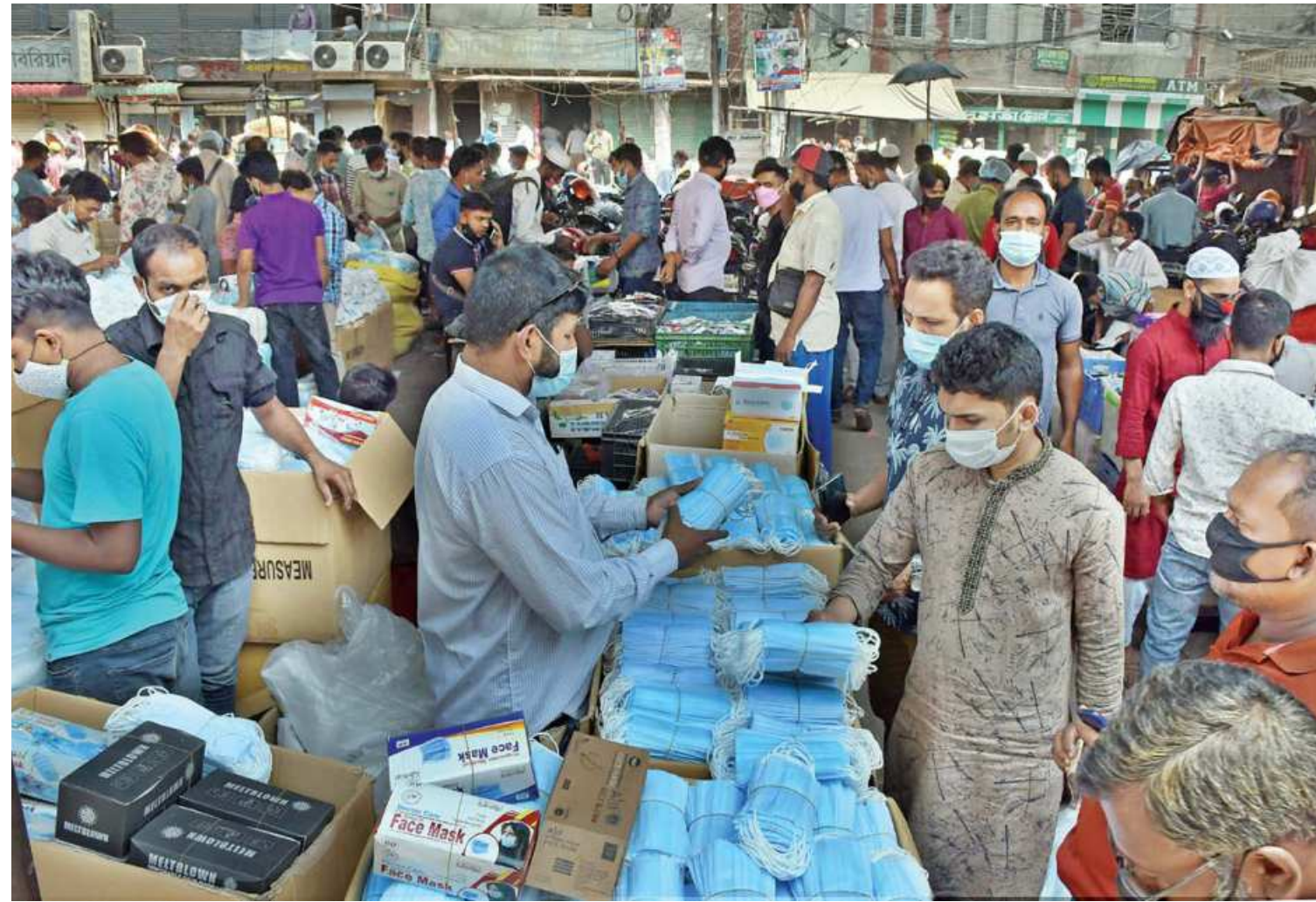
The wholesale market under the second Buriganga bridge on Mitford Road's Babubazar is full of hand sanitizers and masks for sale as the demands for such products have increased with the rising Covid-19 infection rate. Taking advantage of this, salesmen have increased the prices of masks and sanitizers.