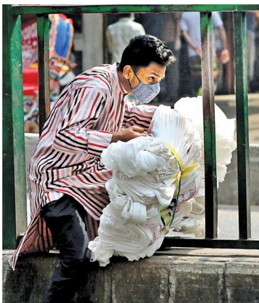
A man crosses the street unlawfully through a gap in the divider with a handful of shopping bags. To make movement "easier", locals near Shantinagar's Habibullah College broke two bars of the guard rails. Taking advantage of this, many people now opt to cross the road through the gap risking their lives.