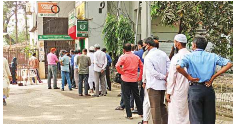
There had been a rush for cash at ATMs around the capital yesterday right after the government declared a restriction on movement for seven days. The photo was taken at National Press Club in the capital.