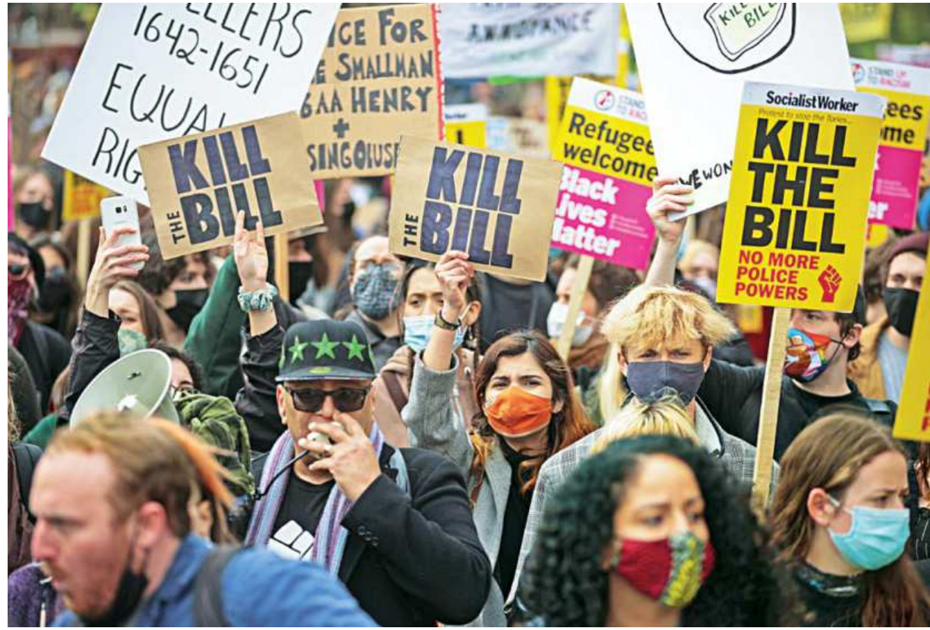
Demonstrators take part in a 'Kill The Bill' protest against the Government's Police, Crime, Sentencing and Courts Bill, in central London, yesterday. The police, crime, sentencing and courts bill would give police in England and Wales more power to impose conditions on peaceful protests, including those they deem to be too noisy or a nuisance to the community. Critics argue this infringes on the right to free and peaceful expression.

France, which like other European allies had been aghast by the last administration's move, hailed the reversal and pledged support for the ICC. EU also welcomed the decision.