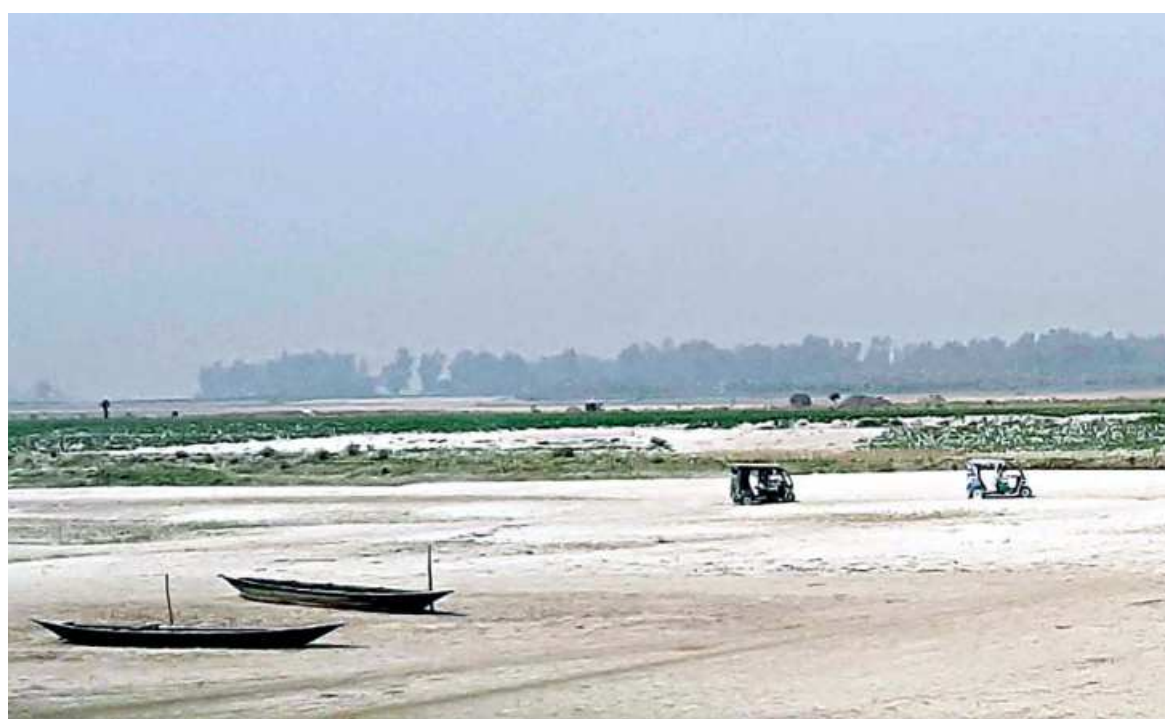
Three wheelers running on the eastern channel of the might Jamuna river at Char Gopal in Tangail. The channel has completely dried up allowing people to use vehicles to go from one place to the other instead of using boats.

Of the yesterday's deceased, 38 were males and 20 were females.