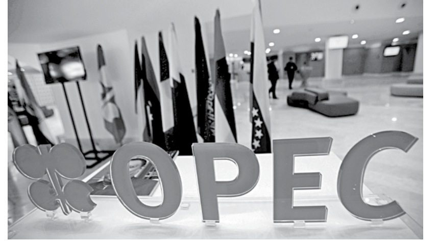
The Opec logo pictured ahead of an informal meeting between members of the Organization of the Petroleum Exporting Countries in Algiers, Algeria.

The cuts were aimed at avoiding limited storage capacity being saturated and supporting prices -- currently hovering around $60 per barrel.