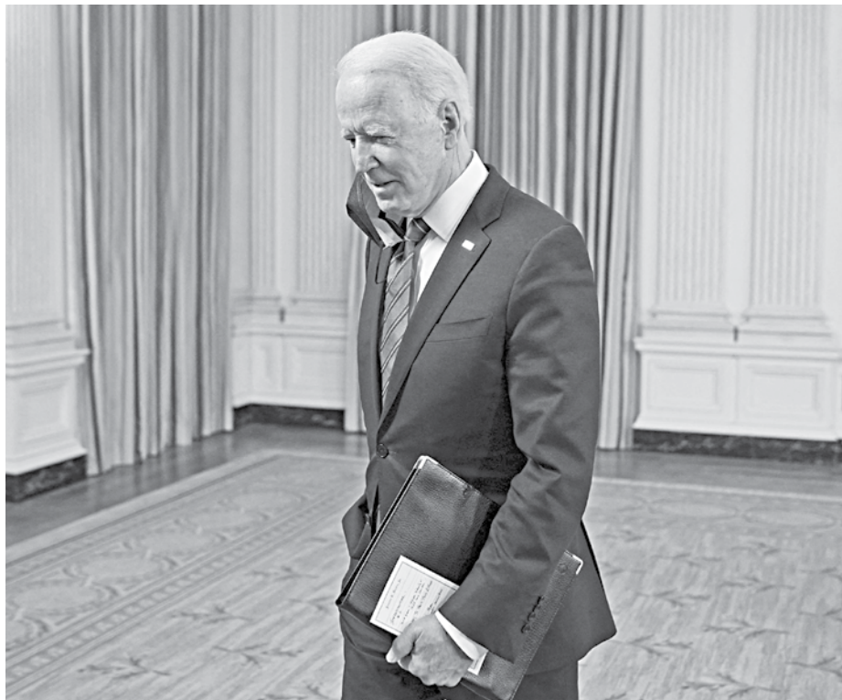
US President Joe Biden leaves after speaking about the March jobs report in the State Dining Room of the White House in Washington yesterday.

White House National Climate Advisor Gina McCarthy also touted the measure in a call with reporters Thursday. "We think it's one of the best methods to actually get the reductions we're looking for with a level of certainty," she said.