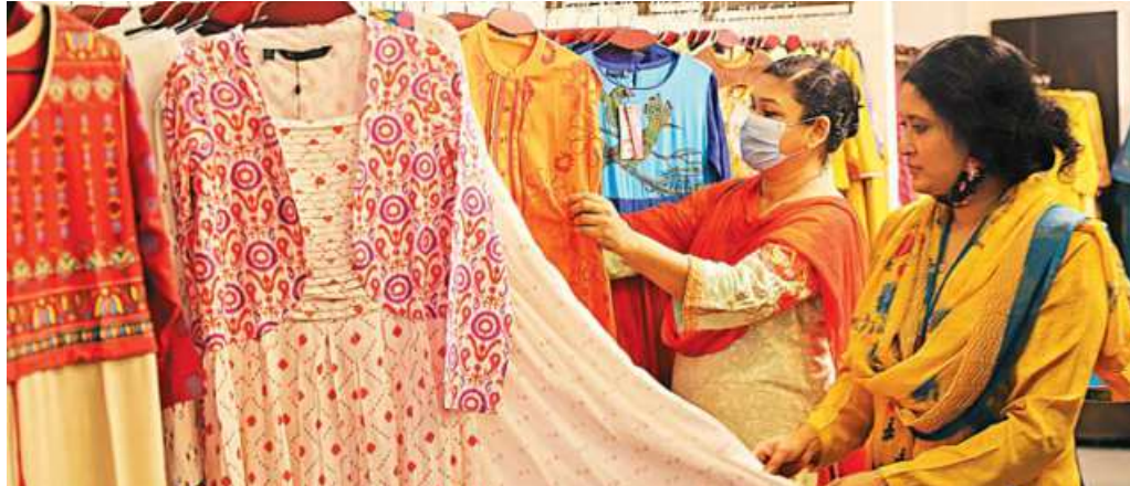
Fashion brands look to have at least 20 per cent of sales online. The photo was taken at a store on Bailey Road in the capital yesterday.

The strategy of lifestyle brand Sara is worth