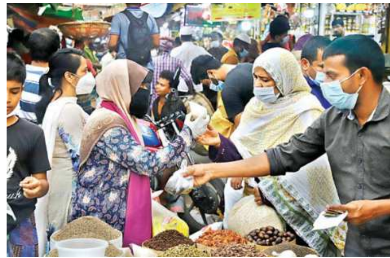
People rushed to the adjacent kitchen markets yesterday in large numbers fearing a further rise in commodity prices after the announcement of a seven-day lockdown from Monday. The photo was taken yesterday from the city's Karwan Bazar.

"I came here [to the mall] soon after hearing the news broke so that I can make the necessary purchases before the price of goods goes up