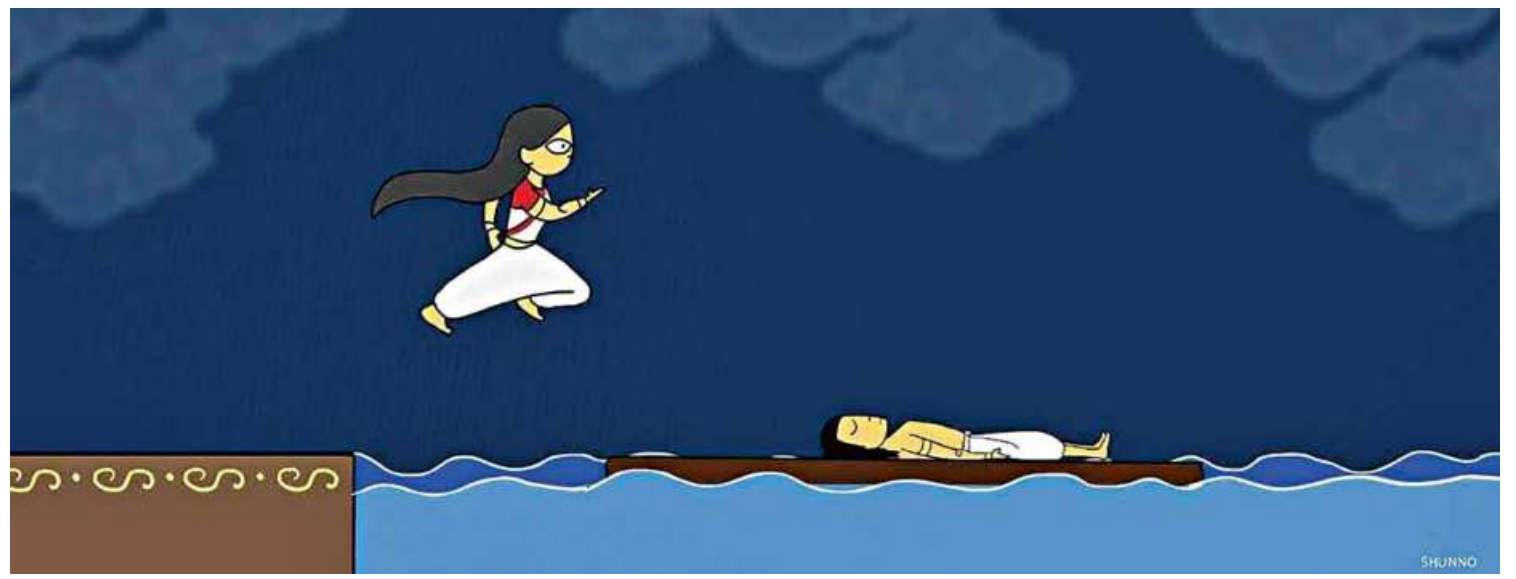
A snippet from "Behula"