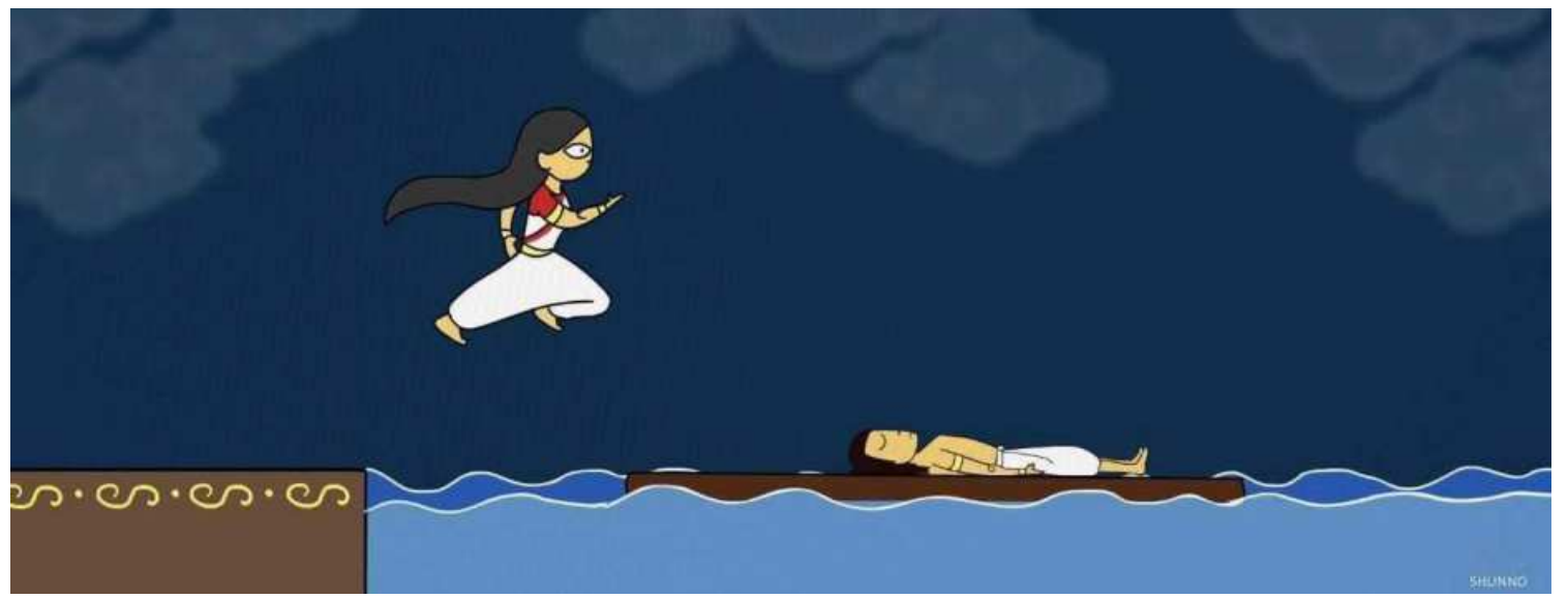
A snippet from "Behula"