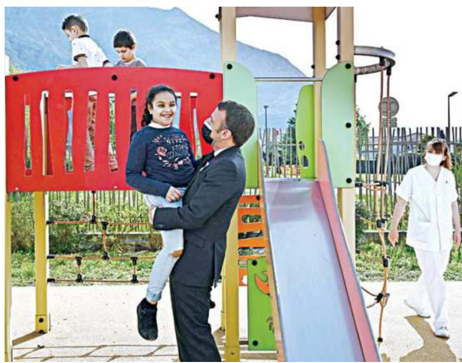
French President Emmanuel Macron carries a child at a playground during his visit to the Autism spectrum disorders (ASD) Unit at Alpes-Isere Hospital in Saint-Egreve on the World Autism Awareness Day yesterday.

The new guidelines prohibit wedding processions, fireworks, dancing and lavish feasts, calling them un-Islamic. It only allows "Dawat-e-Walima", a feast served by the groom's family after wedding rituals are completed.