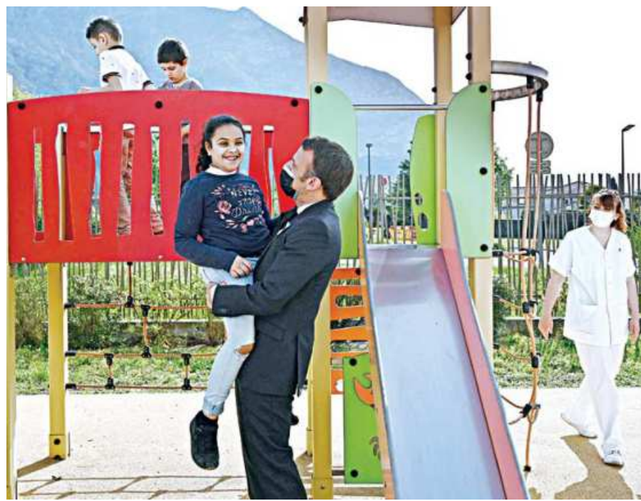
French President Emmanuel Macron carries a child at a playground during his visit to the Autism spectrum disorders (ASD) Unit at Alpes-Isere Hospital in Saint-Egreve on the World Autism Awareness Day yesterday.

The last major train derailment in Taiwan was in 2018 and left 18 people dead at the southern end of the same line. The Apple Daily newspaper said the island's worst crash was in 1948 when 64 died. Another crash in 1961 killed 48, while a 1978 crash left 41 dead.