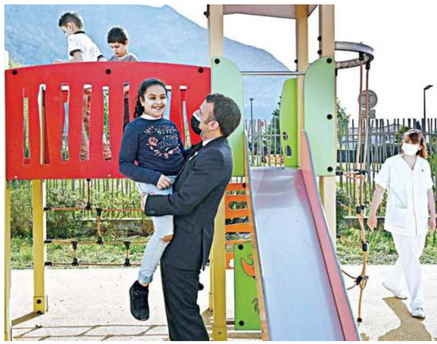
French President Emmanuel Macron carries a child at a playground during his visit to the Autism spectrum disorders (ASD) Unit at Alpes-Isere Hospital in Saint-Egreve on the World Autism Awareness Day yesterday.

The new guidelines prohibit wedding processions, fireworks, dancing and lavish feasts, calling them un-Islamic. It only allows "Dawat-e-Walima", a feast served by the groom's family after wedding rituals are completed.