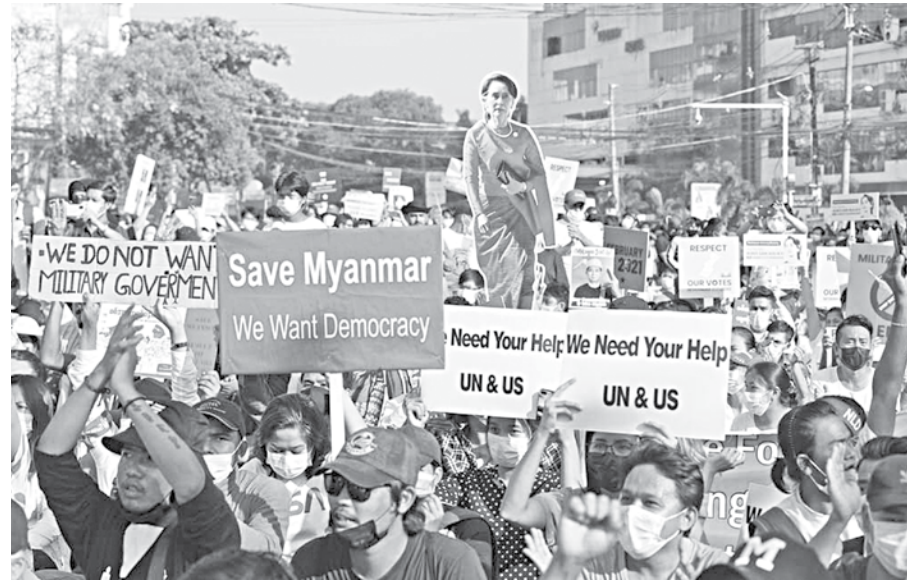
File photo of demonstrators protesting the military coup in Yangon, Myanmar.

An unprecedented public rejection of this takeover has both surprised and unnerved the military who are used to taking people's subservience for granted.