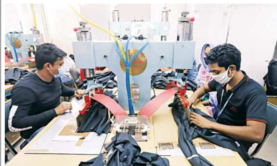
The nine countries, including Bangladesh, account for 70 per cent of the global garment trade.