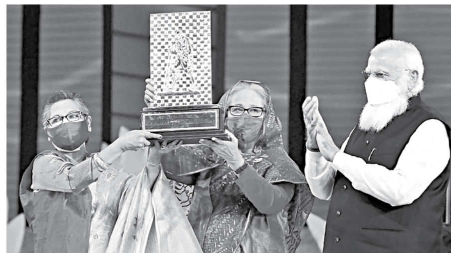
Prime Minister Sheikh Hasina and her younger sister Sheikh Rehana hold high the Gandhi Peace Prize-2020 awarded to Bangabandhu Sheikh Mujibur Rahman posthumously by the Indian government. Indian Prime Minister Narendra Modi is seen applauding next to them.