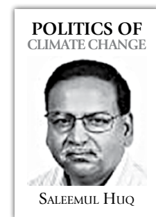
POLITICS OF CLIMATE CHANGE

There is huge scope for collaboration in tackling climate change in the next 50 years