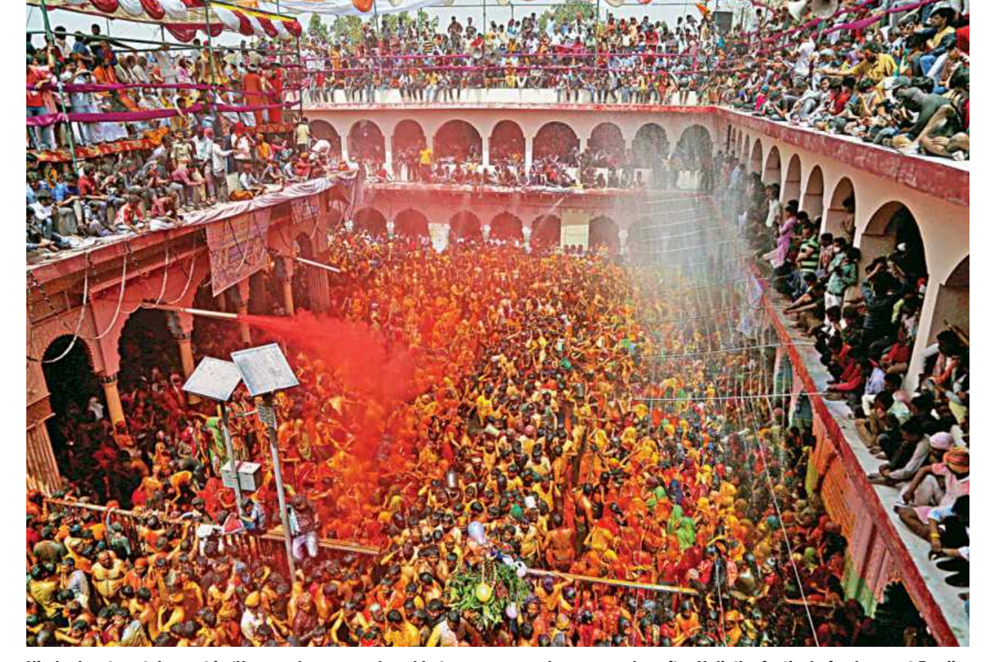
Hindu devotees take part in 'Huranga', a game played between men and women a day after Holi, the festival of colours, at Dauji temple near the northern city of Mathura, India, yesterday. India's Covid-19 situation is turning from "bad to worse," a senior government official said yesterday, as infections surge across several states.

The majority -- 40 seats -- will be chosen by a reliably pro-Beijing committee. The remaining 30 will be chosen by "functional constituencies" -- bodies representing certain industries and special interest groups that have also been historically loyal to Beijing.