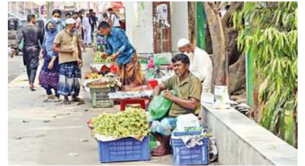
(Clockwise from top) A number of floating people have settled in at the park with their families, much to the annoyance of regular parkgoers. Fruit vendors and other hawkers also take up walkways inside it. Old structures, like this obelisk, appear to not have been cleaned for a long time. The photos were taken recently.