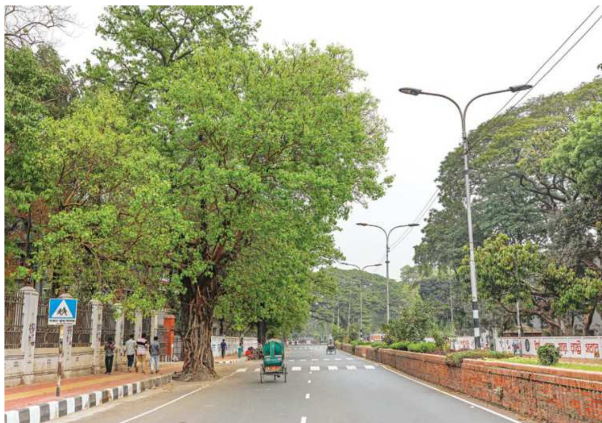
Dhaka was noticeably empty on the government holiday for Shab-e-Barat yesterday, and the leaves were noticeably greener. New leaves of spring are bringing life back to the city after a smoggy winter. This photo was taken at Dhaka University campus.