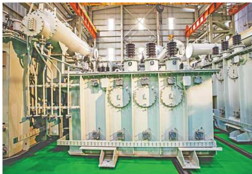
Energypac secured one of the country's biggest export deals with Adani for 70 transformers.

"The company inspected Energypac's manufacturing plant and