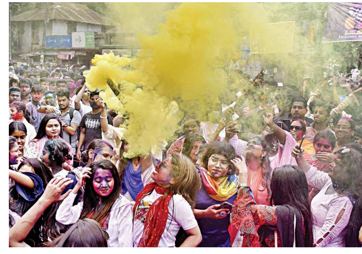
People celebrating Dol Purnima, a major festival of the Hindu community, in Barishal city's Shitalakhola area yesterday. Abir Khela, which throwing of abir (a kind of perfumed and coloured powder) on each other, is a significant part of the festival. The occasion signifies the victory of good over evil, the arrival of spring, and the end of winter.

Three people were killed in firing on protests yesterday in separate incidents elsewhere, witnesses and news reports said. One person was killed when troops opened fire overnight on a group of protesters near the capital Naypyitaw, Myanmar Now news reported.