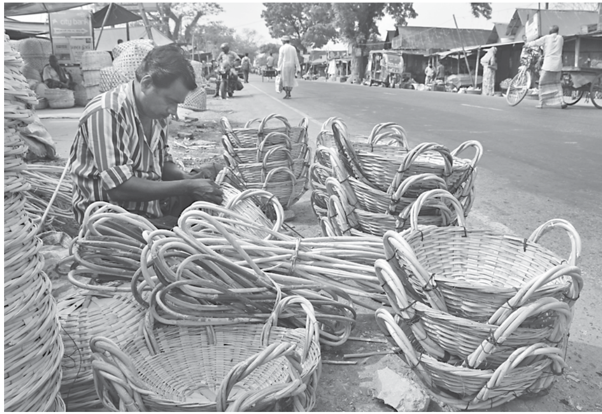
Wicker baskets are a smash-hit at Barishal's Mahilara Bazar on the Dhaka-Barishal highway, under Gaurnadi upazila. Generally used to lift and carry clay, artisans put special attention to craft them as sturdily as possible. This photo was taken recently.

Later, firefighters brought the blaze under control.