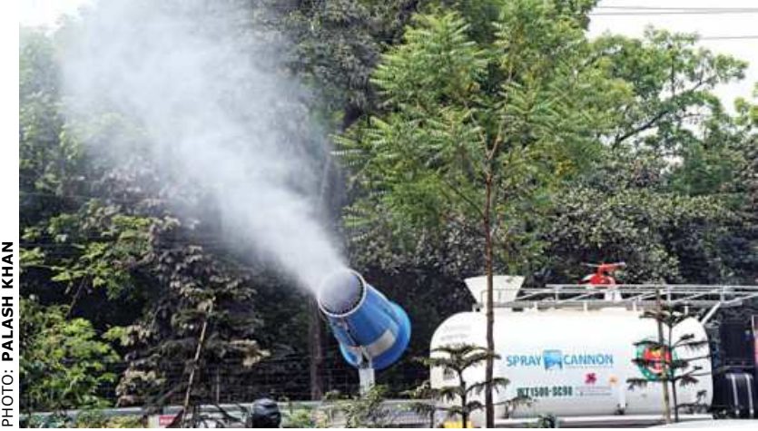
A mist cannon blows water particles at high speed into the air to clear dust near Dhaka Residential Model College. This photo was taken recently.

"It is currently being operated on a pilot basis, particularly around metro rail areas. If it works well, we might buy more," said DNCC Waste Management