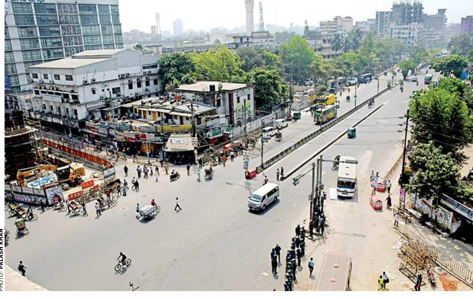
SEE PAGE 4 COL 2 The capital saw sparse traffic throughout the day yesterday, particularly in areas where clashes broke out. The photo was taken near Paltan area.

Earlier in the day, Awami League and its affiliates were also seen patrolling on motorcycles at Malibagh Rail Crossing and Rampura areas since morning. Some of 2 them had sticks and hockey sticks in their \Xi