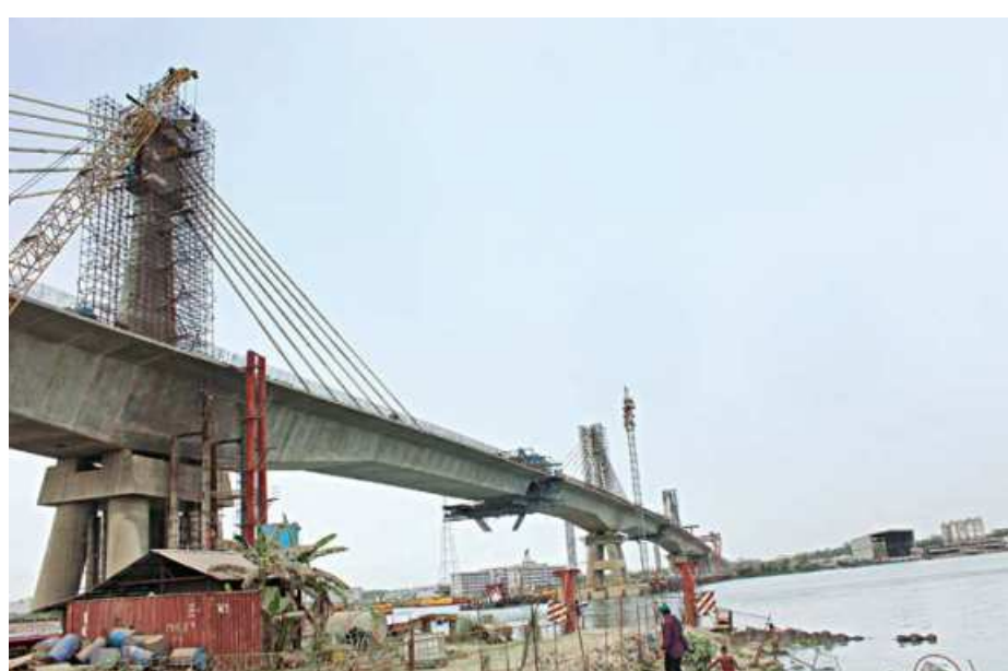
About 90 per cent of the main bridge is complete while the construction of ancillary structures is ongoing.