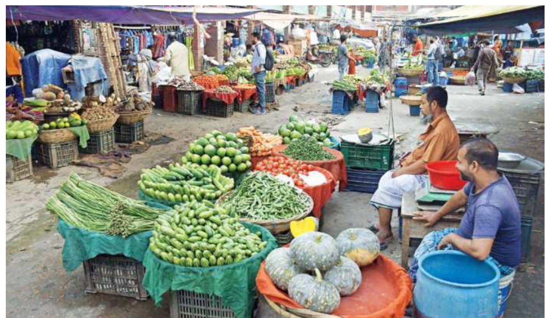
The day was just like any other for vegetable sellers staying open at Karwan Bazar in Dhaka yesterday although customer presence had been low amidst a countrywide hartal called by Hefajat-e-Islam. The photo was taken in the afternoon.