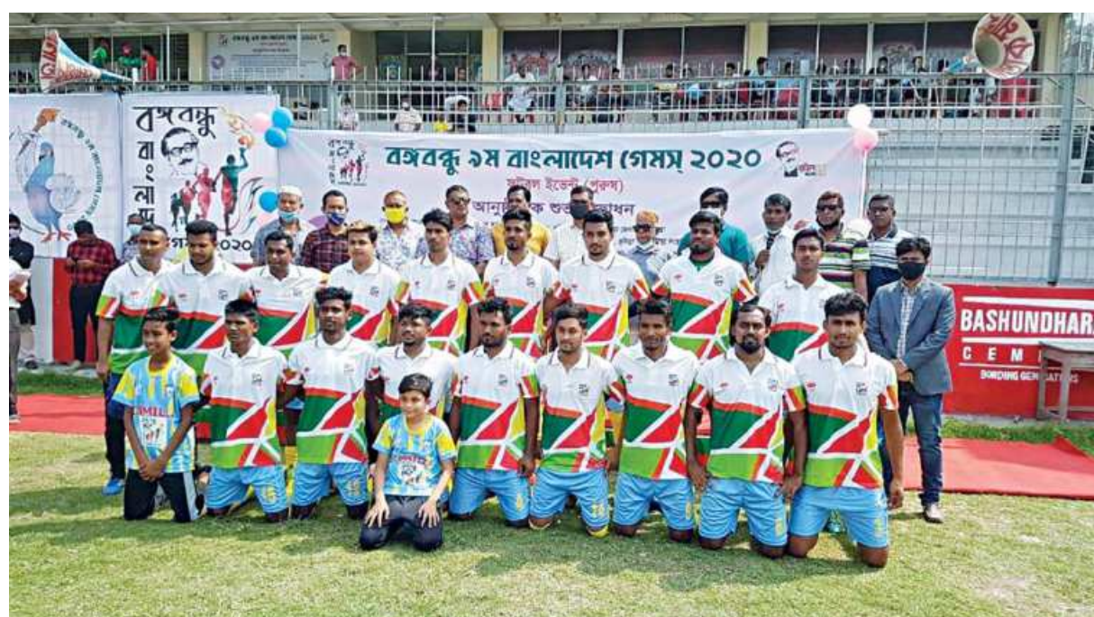
Officials and players of the two teams pose for a photograph ahead of the opening match of the men's football event of Bangabandhu 9th Bangladesh Games at the Shaheed Dharendra Nath Dutta Stadium in Cumilla yesterday. Hosts Cumilla lost 3-0 against Satkhira in the opening match. The second match of the day saw Rangpur beat BKSP 2-1. A total of 10 teams, split into two groups, are taking part in the tournament, the final of which will be held on April 9.

Both teams made all five substitutions in the second half, but there were hardly any goalscoring opportunities for the hosts as Bangladesh defended Nepal's flurry of attacks manfully.