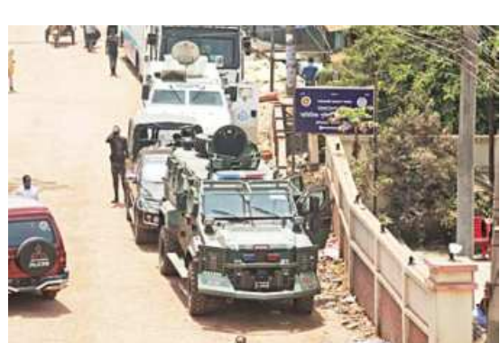
Activists of Hefazat-e-Islam build lines of defence on a road near the main gate of Hathazari Madrasa in Chattogram yesterday while policemen stand guard in front of them. Vehicles of Border Guard Bangladesh and police take position, bottom right, to tackle any untoward incident there. The activists also brought out a procession in the port city's Jamiatul Falah mosque area, top right.