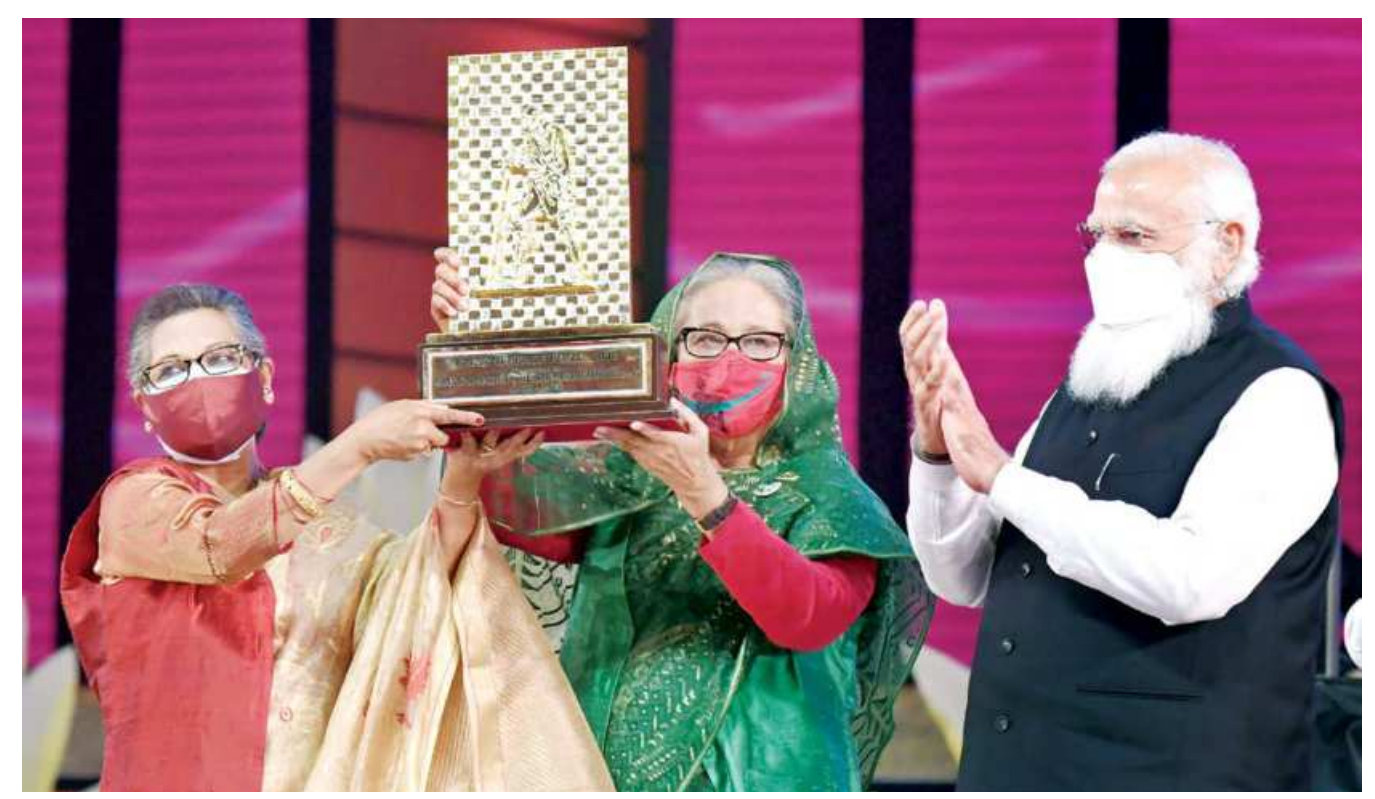
Prime Minister Sheikh Hasina and her younger sister Sheikh Rehana hold high the Gandhi Peace Prize-2020 awarded to Bangabandhu Sheikh Mujibur Rahman posthumously by the Indian government, Indian Prime Minister Narendra Modi is seen applauding next to them on the final day of twin celebrations at the National Parade Square yesterday.