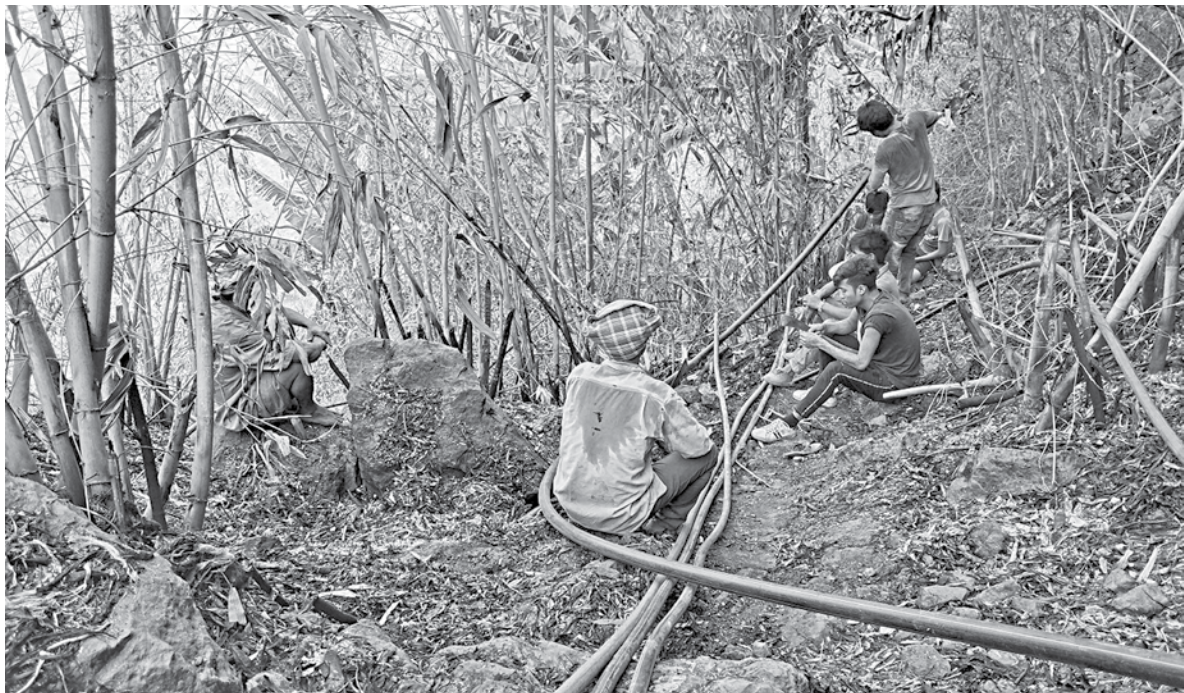
A devastating fire on Tuesday damages around 5,000 feet water supply pipeline of Mro community who have been protesting the construction of a luxury hotel in Bandarban’s Chimbuk hill area. The fire also destroyed fruit orchards, belonging to the indigenous community people, on over 100 acres of land.