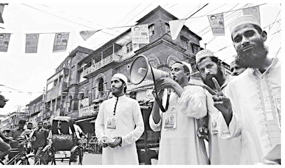
In the absence of a strong opposition camp, faith-based groups are becoming the X factor in politics.

in the aforementioned article was the harmful consequences of denying political space to the opposition and reducing state institutions to a level where they no longer serve the nation, but instead become the handmaiden of the administration. Three long-term but extremely damaging consequences that result from this state of affairs are: the main opposition party becomes a political non-entity, elections become an exercise