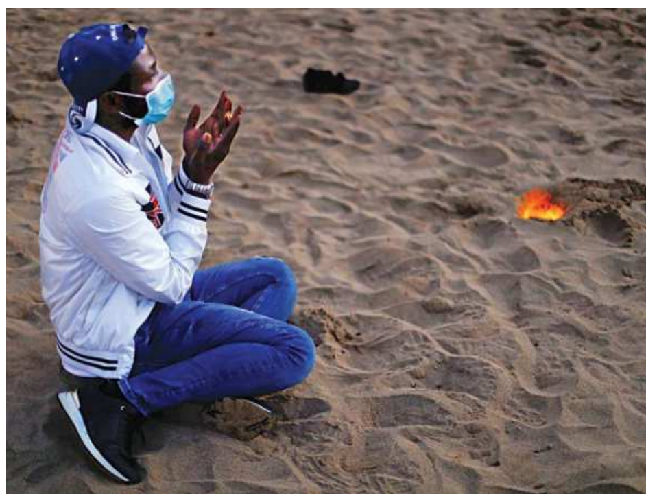
A man prays yesterday next to a lit candle on the beach of Las Canteras, in Las Palmas, to pay tribute to a two-year-old migrant girl who died on March 21, at a hospital after being rescued off the island of Gran Canaria, Spain. More than 1,200 migrants died last year trying to reach Europe by crossing the Mediterranean, according to the International Organization for Migration (IOM). Since January, 295 migrants have died or gone missing while trying to make the journey.