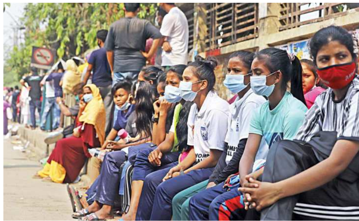
Women footballers of Ansar waiting in front of Mugda General Hospital in the capital yesterday to get tested for coronavirus ahead of the 9th Bangabandhu Bangladesh Games scheduled to launch on April 1. The country is witnessing an unexpected rise in new cases.

Spanish Ambassador to Bangladesh Francisco de Asis Benitez Salas among others spoke at the programme.