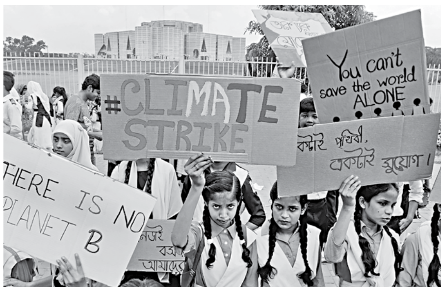
Student demonstrations at Manik Mia Avenue in Dhaka on September 20, 2019, urging the world leaders to act against climate change.