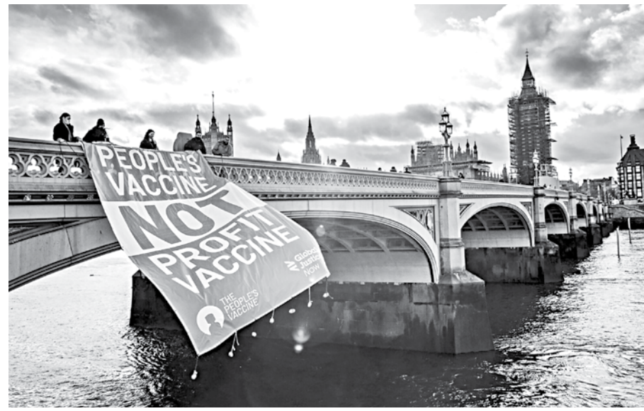
Thousands of activists across the world demanded a People's Vaccine as part of the global day of action on the first anniversary of the World Health Organization declaring coronavirus a pandemic.