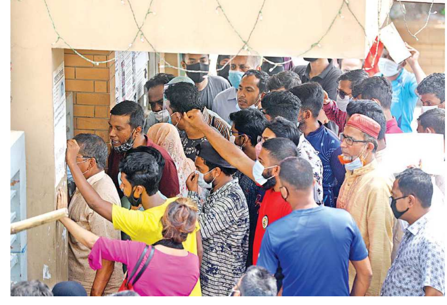
People express their displeasure to the person sitting in a counter at Mugda Medical College Hospital yesterday after being refused for Covid test at 11:00am yesterday. Many of them had waited hours to get tested at the hospital only to be told that sample collection was done for the day.

After losing their job in a garment factory during the lockdown, her two daughters came back home in April last year. "Now we are completely broke."