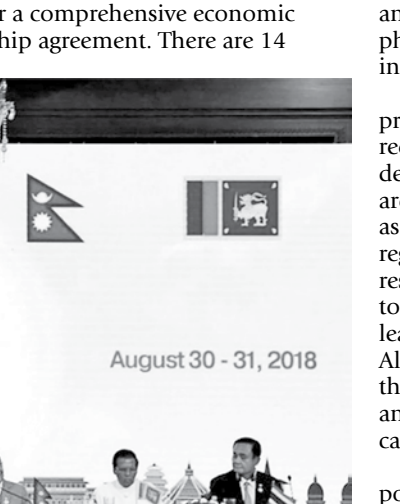
The inaugural session of the 4th BIMSTEC summit in Kathmandu on August 30, 2018.

To enhance the trade and investment nexus in the BIMSTEC region, the Free Trade Area (FTA) negotiation needs to be finalised and efforts should be made for a comprehensive economic partnership agreement. There are 14