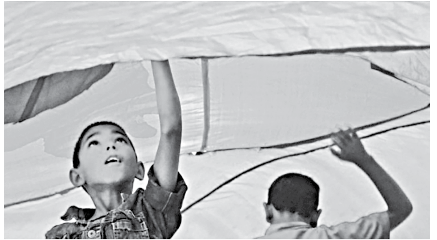
As we celebrate the achievements of the last 50 years, we also have to work towards consolidating what has been achieved during this period.

Fourth is the investment on human capital. In fact, how Bangladesh will benefit from the 4IR will depend on its preparedness in terms of educating and training its human resources and providing access to technologies. With the current level of public investment in education, young graduates do not gain the required skills for the job market. In the new context of technology-based work, more government investment in ICT education is required. A digital divide is already being observed during the ongoing pandemic. This may accentuate further if the poor do not have access to technology and opportunity for learning technical skills. The youth are the most important human resource for Bangladesh. It can benefit from its demographic dividend by engaging the trained and skilled youth in the economy. Experts suggest that Bangladesh's