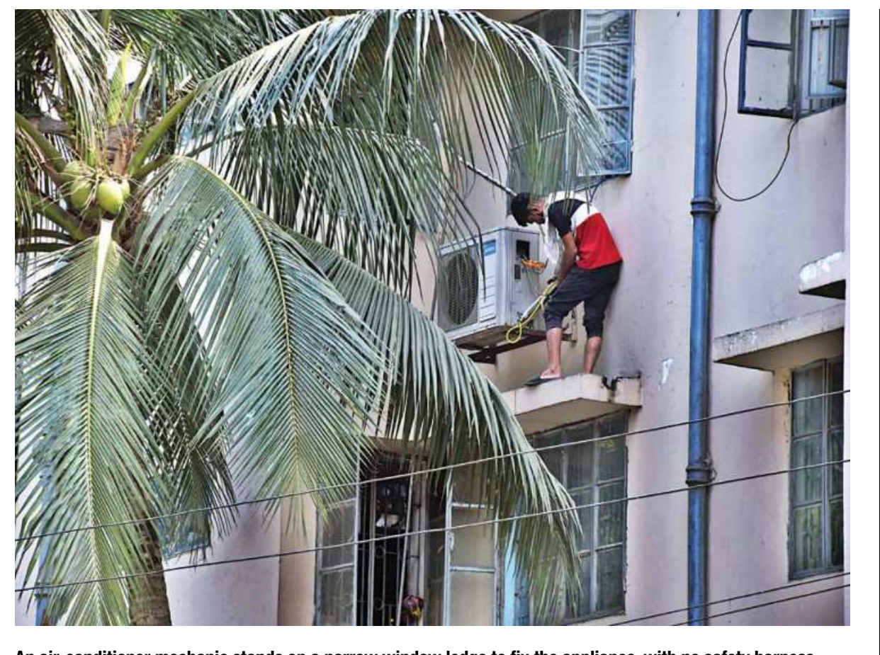
An air-conditioner mechanic stands on a narrow window ledge to fix the appliance, with no safety harness. As summer is in full gear, such mechanics can be seen in precarious positions in the coming days, neglecting safety equipment. This photo was taken yesterday from Dhaka University area.

According to the directives, community centres can only fill one-fourth of their total seating capacity at any programme, while the presence of over 100 guests is strongly discouraged.