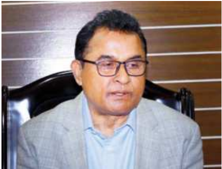
AHM Mustafa Kamal

Citing a quote of Bangabandhu Sheikh Mujibur Rahman that says independence would be valueless if each countryman cannot get food, accommodation and a sound life, the minister urged all to continue working to achieve economic emancipation as dreamt by the father of the nation.