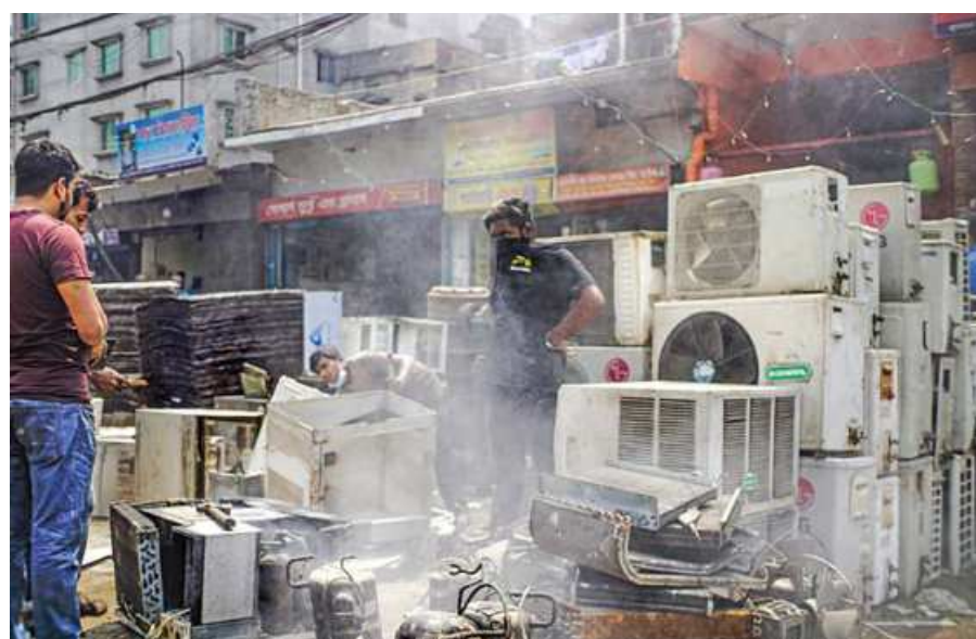
Gas being discharged from AC compressors at a store in the capital's Dholaikhal area yesterday. The people who are doing it seem to care little about the environment and run their recycle and repair businesses occupying pavements and streets.