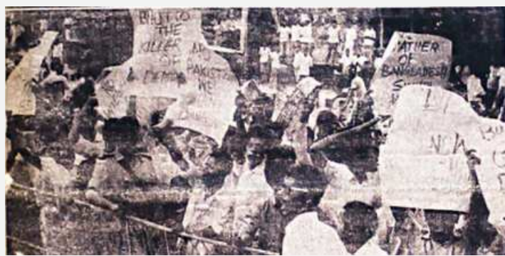
Protest against Bhutto's visit in Dhaka on March 21, 1971.