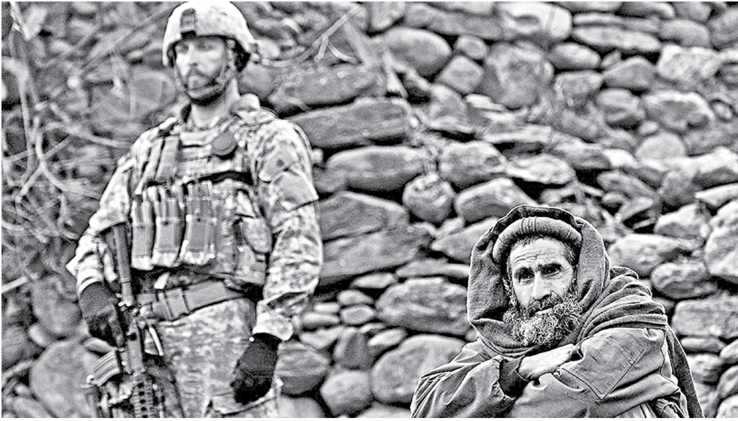
On February 20, 2020, the US government and the Taliban signed a peace treaty to enable US troops to withdraw from Afghanistan after almost two decades