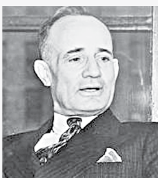
NAPOLÉON HILL American author (1883—1970)

"Truly, thoughts are things, and their scope of operation is the world itself"