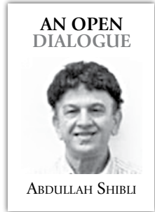
AN OPEN DIALOGUE