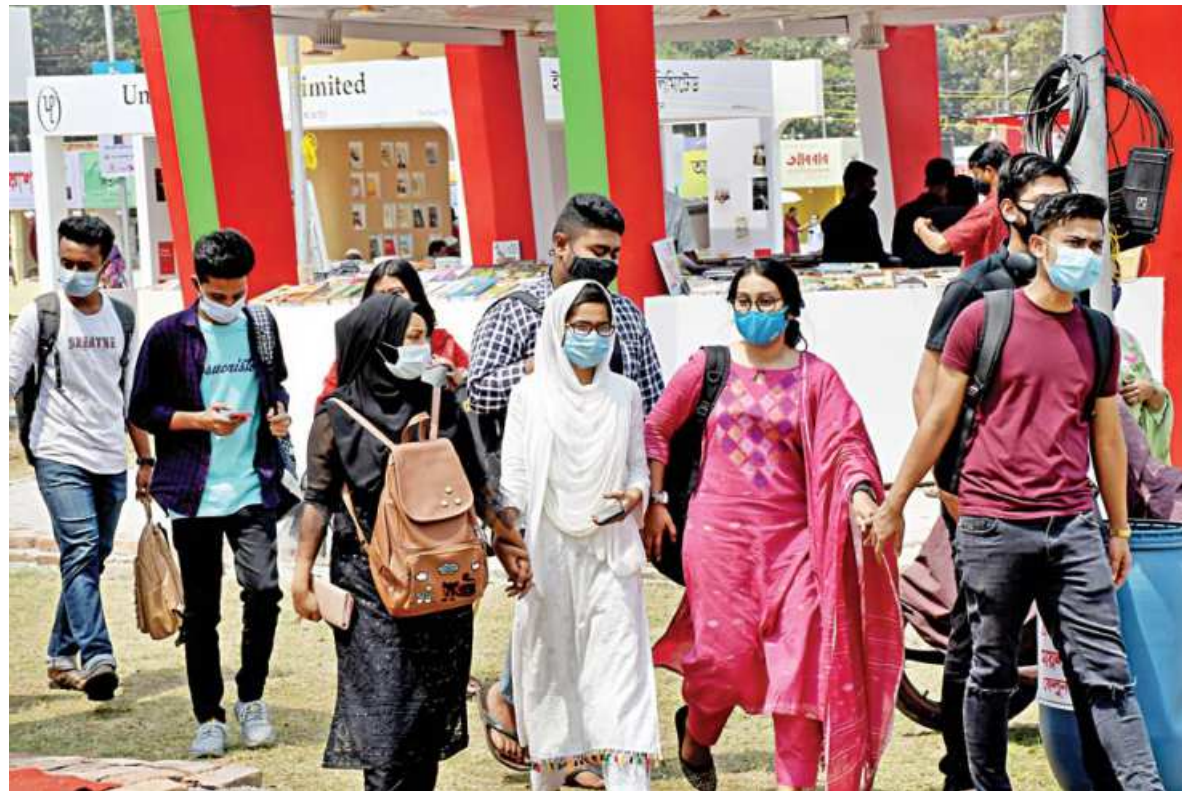
The first weekends of the Boimela saw a steady increase in visitors' numbers throughout the day. They said they were glad to have this opportunity to come here with their friends and families, something they've been unable to do as much due to the pandemic.