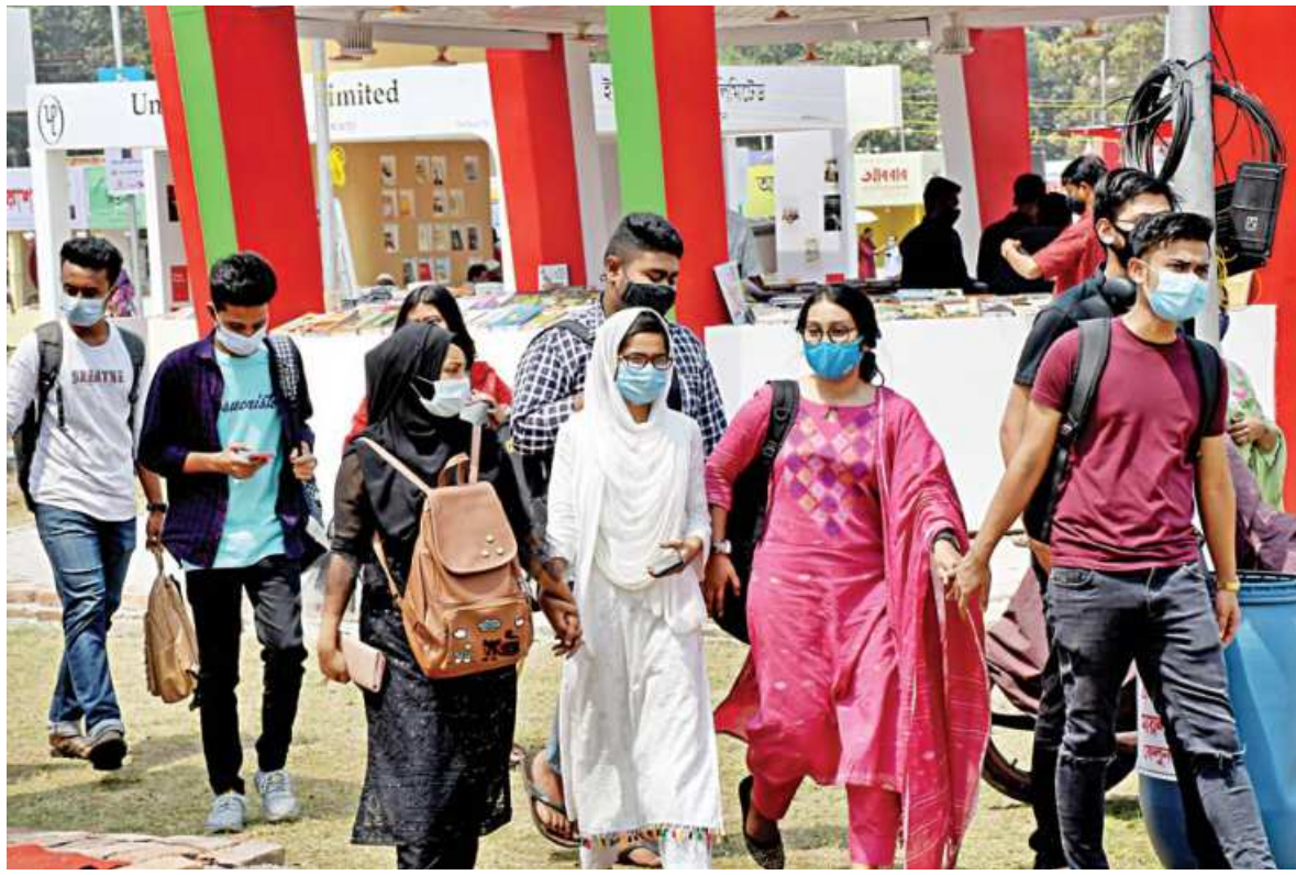
The first weekends of the Boimela saw a steady increase in visitors' numbers throughout the day. They said they were glad to have this opportunity to come here with their friends and families, something they've been unable to do as much due to the pandemic.