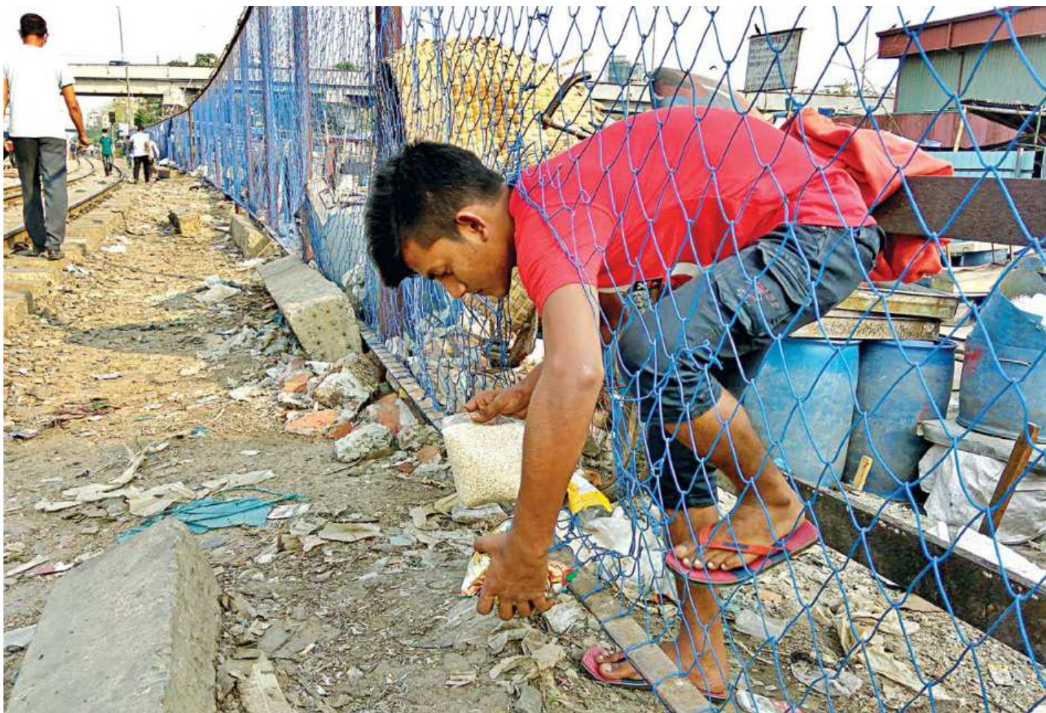
A young man performs the tricky task of going through the fence while holding his groceries near a construction site by the rail lines in the capital's Tejgaon. There are people walking and on and along the lines too. People would often take risks and go to extraordinary lengths just to save a couple of minutes.