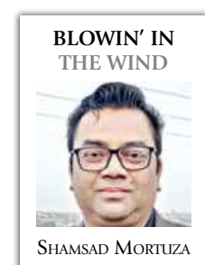
BLOWN' IN THE WIND