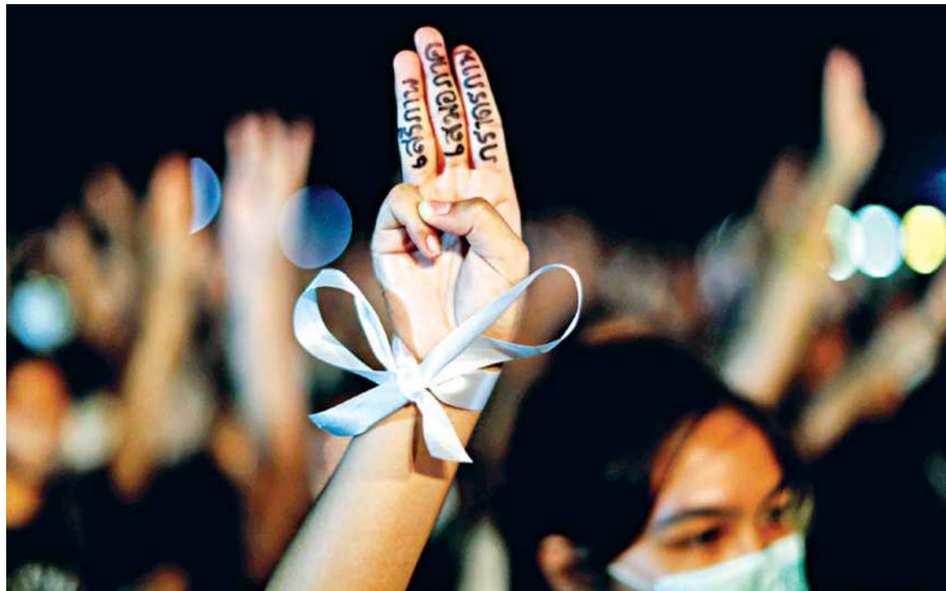
A pro-democracy student raises a three-fingered salute, with 'freedom, equality and brotherhood' written on their hand and a white ribbon around their wrist.

Then there are other kinds of realpolitik. One may argue, why the younger generation of Myanmar did not speak against the same military junta when they exterminated an entire ethnic community in the Rakhine province? Why did one action of the military receive endorsement by the protesting mass, while the other one did not? How are antibodies created within a body? What prompts reactions? What does not? If we are to talk of democracy, then should we not think of all members and groups living in a democratic society?