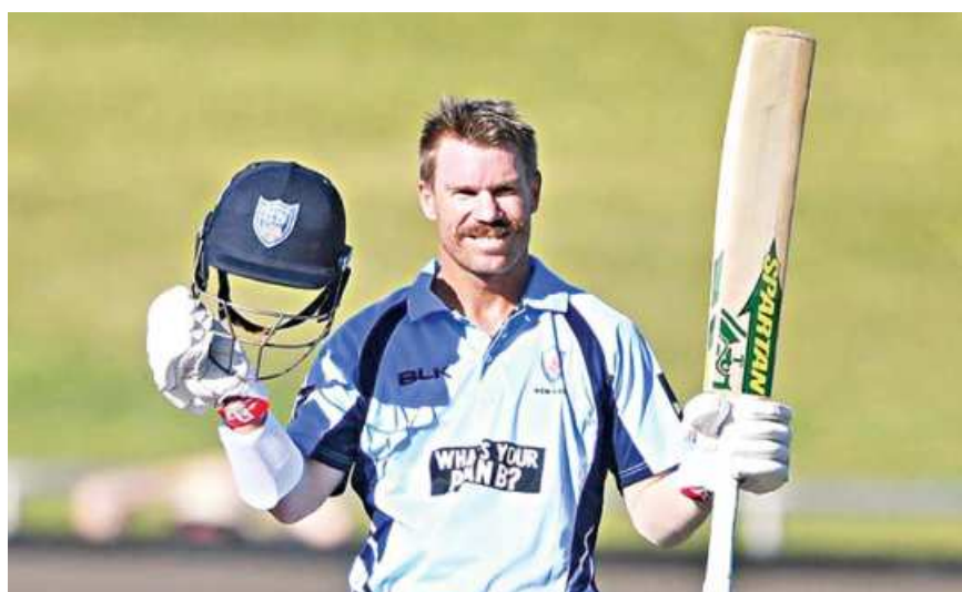
Australia opener David Warner hit his first century (108 off 115 balls) in 14 months to help New South Wales maintain their unbeaten record in the domestic Marsh One-Day Cup yesterday.

She added that BFF coaches would be deployed in each of the seven venues to scout talented players that will later be given advanced training and groomed for national age-level teams.