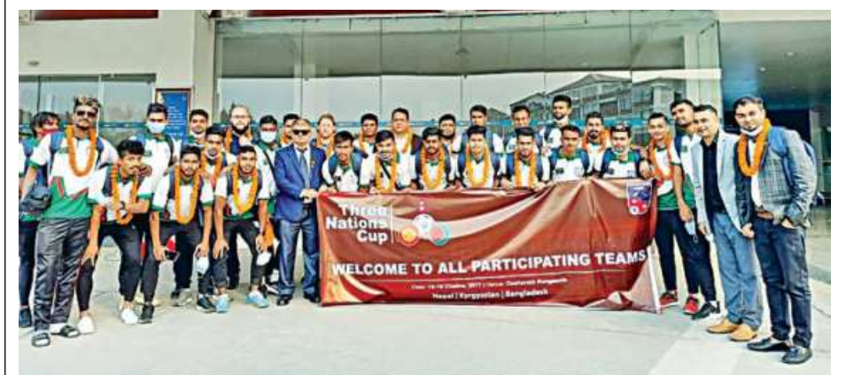
All Nepal Football Associations (ANFA) officials welcome the Bangladesh team upon their arrival at the Tribhuvan International Airport yesterday. Bangladesh will take part in a three-nation tournament which begins from March 23.