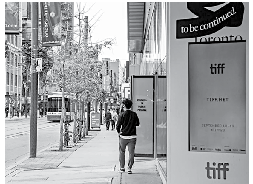
King Street West is seen nearly empty a day before the Toronto Film Festival in Toronto, Ontario, Canada.

The IMF forecast economic growth of 4.4 per cent this year after a 5.4 per